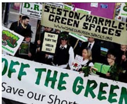
'Mourners' at a 'Don't bury the greenbelt' demonstration.

We want the housing numbers reduced, with the development of brownfield land first and a proper system of funding affordable housing. The scale of the development will also be a transport disaster for our area because we do not have an Integrated Transport Authority to plan public transport in conjunction with